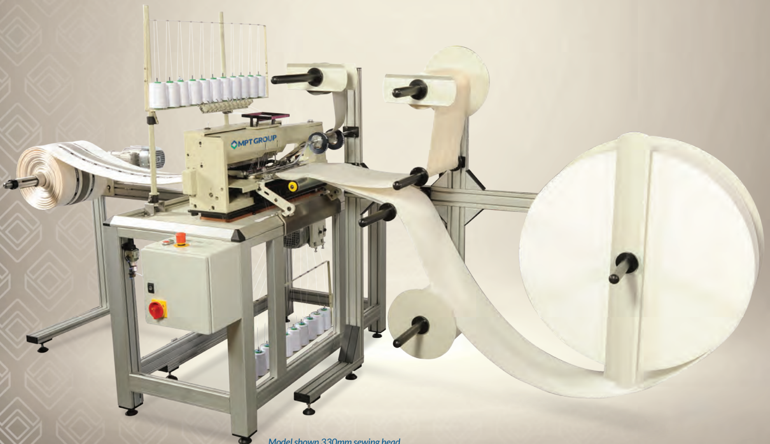
Model shown 330mm sewing head