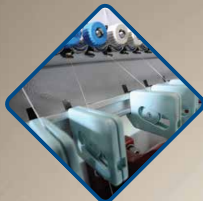
Robust loop holders